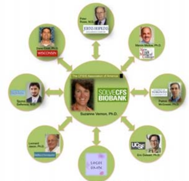
RESEARCH INSTITUTE WITHOUT WALLS

The Association announces its research institute without walls -- eight tightly integrated projects led by experts in diverse disciplines. Rather than expending precious funds -- and time -- to construct a bricks-and-mortar facility, we have attracted top institutions to put their best minds to work immediately. We function as director and connector, networking carefully selected