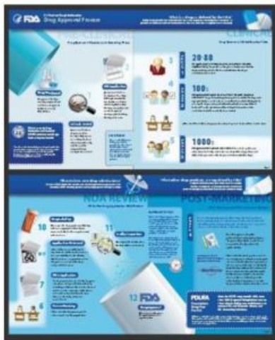
Ampligen declined FDA approval

The U.S. Food and Drug Administration (FDA) declined to approve Hemispherx Biopharma's application to market its experimental drug, Ampligen , for CFS. The decision, announced on Feb. 4 by Hemispherx, was a great disappointment to many in the CFS community, especially those who have benefited from the drug. Read more about the decision, attention it attracted, and the long history of this drug: http://bit.ly/ampligen-decision