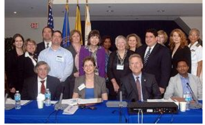
Federal CFS Advisory Committee